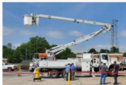
Aerial Lifts & Bucket Trucks