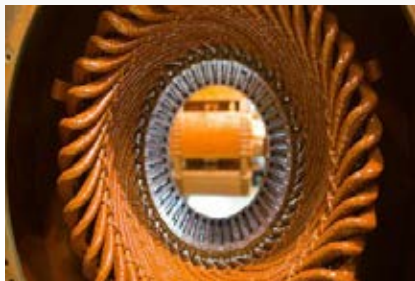
Motors and Generators

The PTS series are designed for field, shop or factory testing of shielded power cables, switchgear, wire harnesses, motors, generators, hotline tools/safety products, aerial lifts/bucket trucks and substation apparatus. The PTS series is ideal for any DC over voltage withstand test. The guard-ground circuit allows for precise leakage current measurement. The built in megohmmeter scale inverse to the current meter scale allows for accurate insulation resistance measurements able to be taken at any voltage.